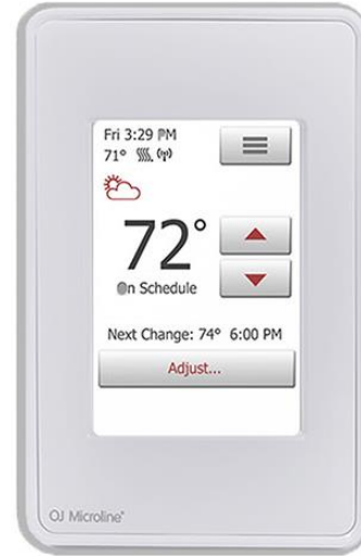
Thermostat (Different Models Available)