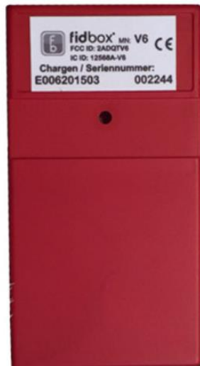
Temp. and M.C. Data Logger (Fidbox® Installed in the Floor)