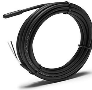
Floor Temperature Sensor (Installed in the Floor)